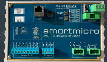
COM HUB® Relay 8

Switching to object-based data transmission via MQTT eliminates the need for predefined radar zones and paves the way for intelligent, adaptive traffic control.